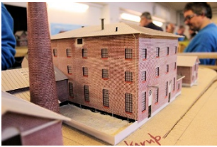
Karup Model Anno 1933.

In the year 1900, production of potato starch on an industrial scale took place for the first time in Denmark.