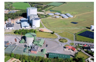
Karup Anno 2017

Exactly 25 years later we were asked to triple the capacity once more.