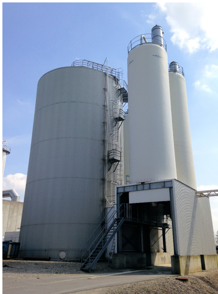
Thousands of tonnes of native potato starch are each year filled in road tankers from silos like this one.